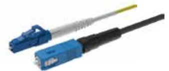
FUSION SPLICE-ON CONNECTORS